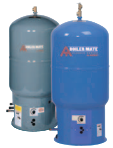
Available with SmartControl or Standard Dial Aquastat