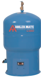
Available with SmartControl or Standard Dial Aquastat