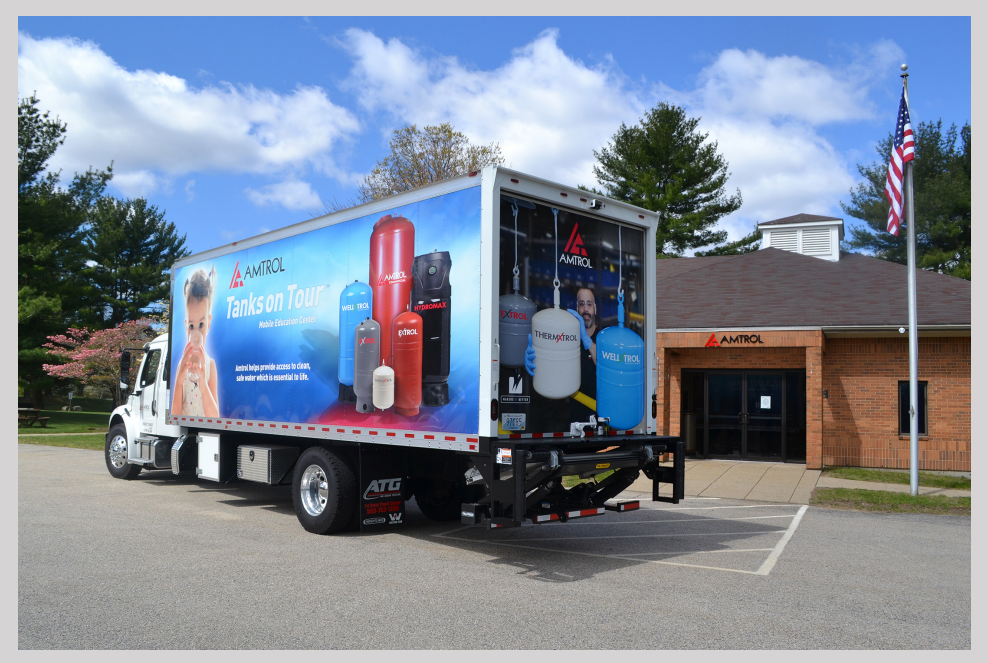
Tanks on Tour™ in front of the Amtrol Education Center.

All models are Amtrol Rewards<sup>™</sup> eligible. Visit amtrolrewards.com