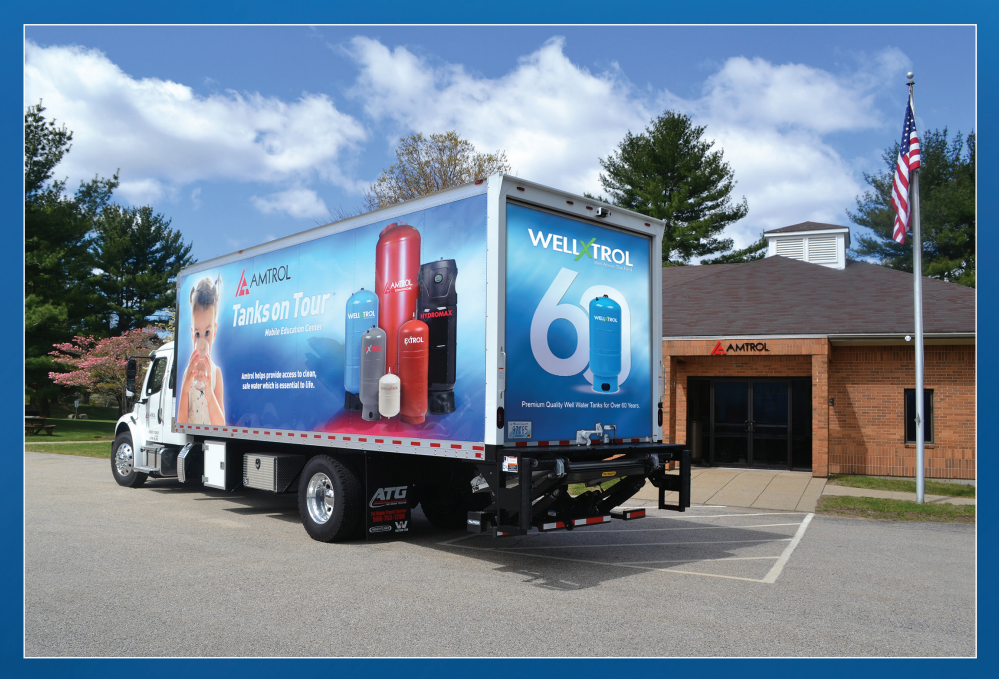
Tanks on Tour™ in front of the Amtrol Education Center.

All models are Amtrol Rewards<sup>™</sup> eligible. Visit amtrolrewards.com